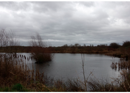
Altrincham Wastewater Treatment Works pond

4 Firs Wood: This small mature woodland provides excellent habitat for woodland birds. It offers access to Carrington Moss and a vast network of paths and tracks, including the Trans Pennine Trail.