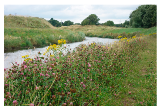
The River Mersey