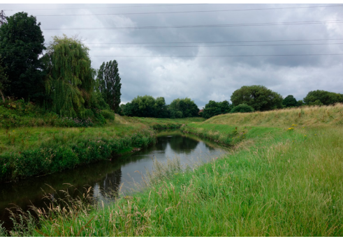
The River Mersey