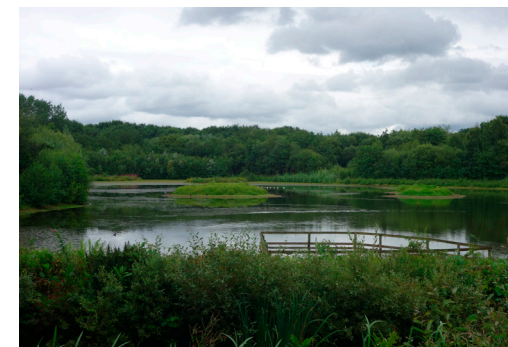
Broad Ees Dole

5 Heritage Beeches: Enjoy the 'avenue' of mature beech trees within Priory Gardens. Look out for the fire damaged beech which continues to support wildlife, including interesting fungi.