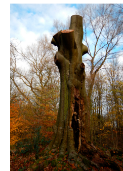
Pollarded heritage beech