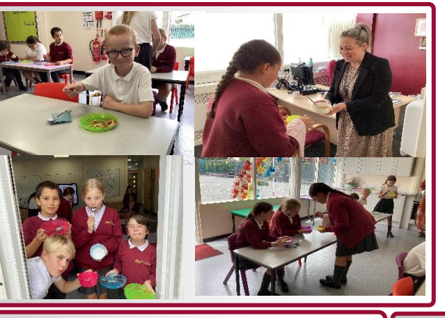
Year 5 enjoyed making their Bolognese this week. They have learnt how to adapt the recipe to ensure that they were making healthier choices.

Massive thank you to Dunelm Trafford who have delivered bags of joy to selected pupils. This is a wonderful community gift.